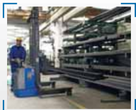
Lateral movement left or right

Movement in 4 directions solves the problems associated with handling wide loads such as bars and pipes in confined spaces and narrow aisles.