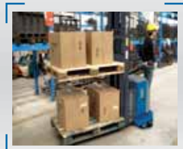
Handles two loads simultaneously, one on the forks and the second on the legs.

With a built-in leg lift, the DELTA TP is the perfect solution to handle loads in places where you need to pass over ramps, skids, small obstacles and floor irregularities.